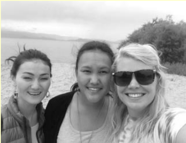
Thank you for being part of my journey!

People who pledged to give, for the most part, continued to give, and others were generous with one-time giving and there was always enough money. However, as I review the last year, with summer camp expenses and my travel home, I am coming up a little bit short. It is close considering the amount I raised for the almost three and a half years of ministry, but I still need a bit more to leave in good standing. I would like to close out my account with Intervarsity soon, but I need to make up a difference of about $4,000. If you are able to support my ministry I would greatly appreciate it. You have all been such an integral part of my journey and without you, it wouldn't happen!